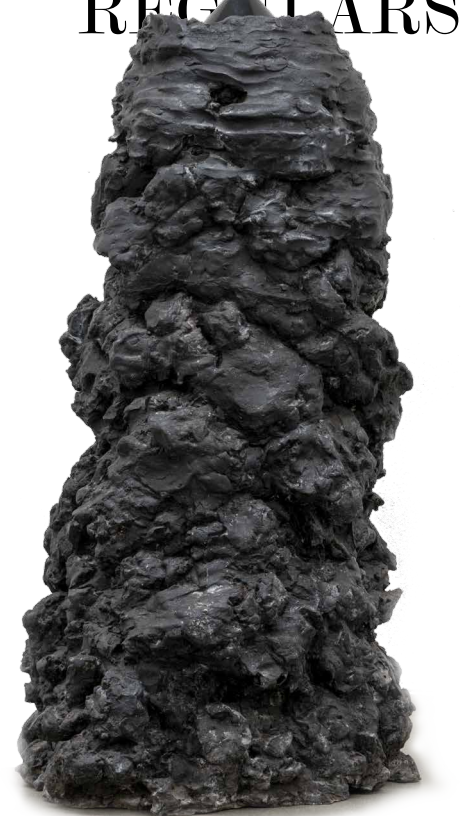
Nobuo Sekine Phase of Nothingness — Black No.13 , 1977

impetus behind the work had always been to enable viewers to experience topological space.